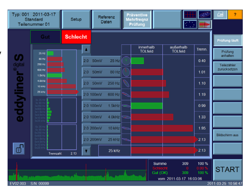
Display with eight tolerance zones as bargraph diagram