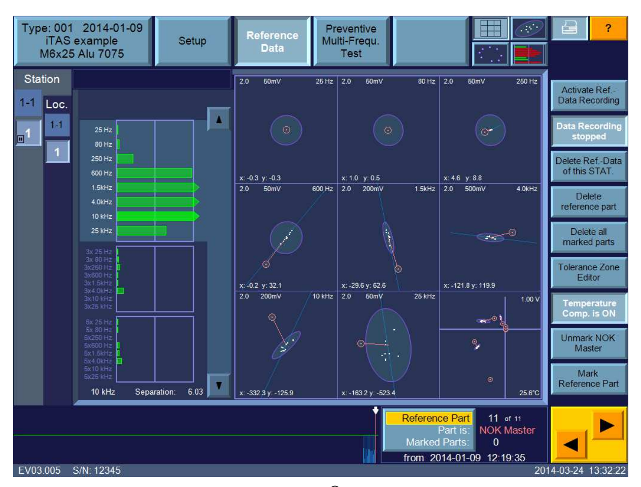
Screen of the eddyvisor® with activated iTAS

As usual, the instrument is calibrated with only OK parts. Now, however, OK parts at different temperatures are also included in order to generate a temperature compensation curve.