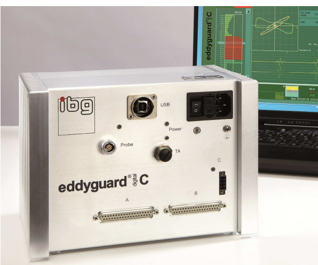
eddyguard® S and eddyguard® C