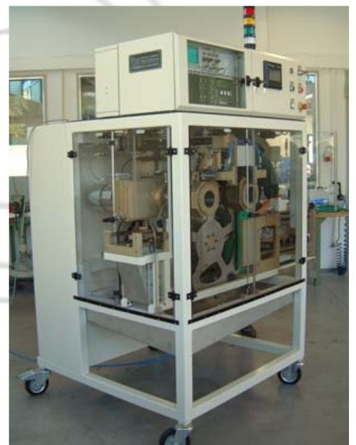
Overall view of test system.