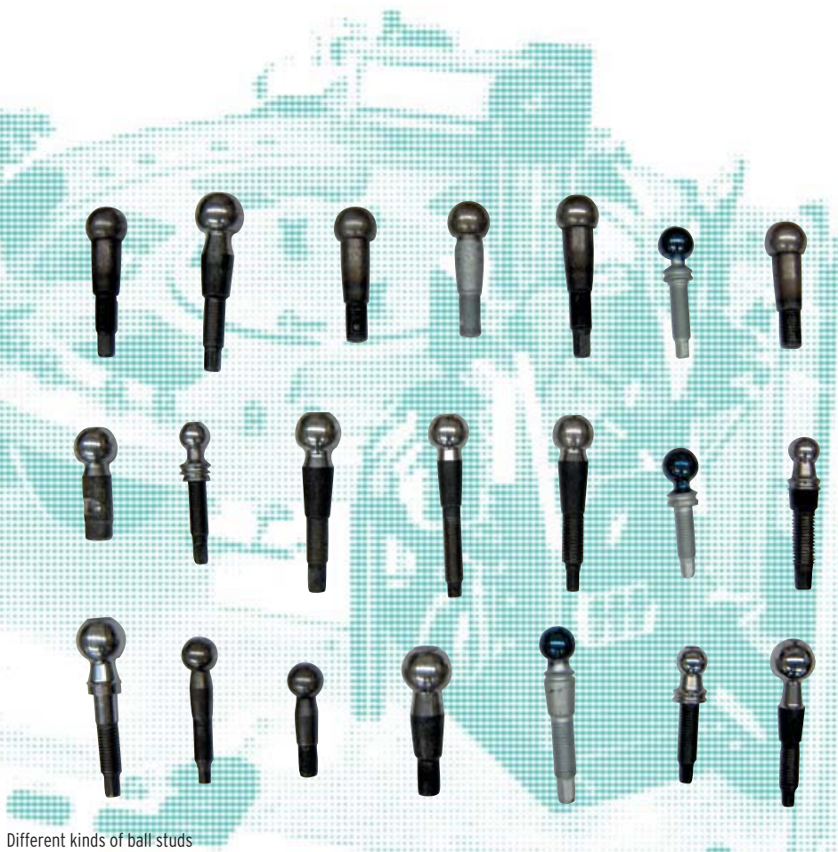
Different kinds of ball studs