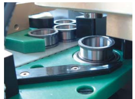
Test parts are moved individually to the actual test station.