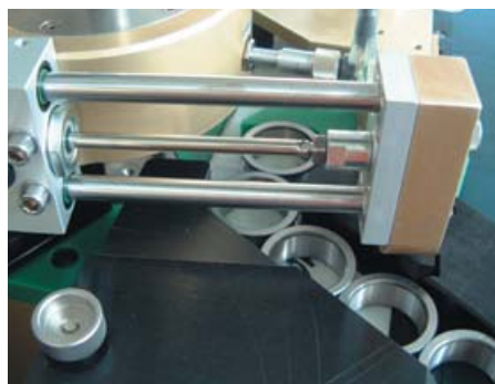
The rings are transported from a belt to the crack test system.

The system is designed to be very space-saving and by means of rollers can be moved and connected to different production lines.