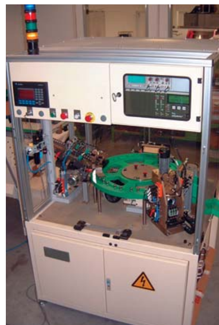
Test system with crack test station in twin design. On the left-hand side in the photo: Feeding and separation. On the right-hand side in the photo: The OK parts leave the system via the chute. The NOK parts are sorted out in the middle of the back-side

A test system, as shown in photo on the right-hand side for example, automatically tests up to 6,000 ball studs per hour for surface cracks and correct heat treatment. The ball studs are tested either after the forming process or after the succeeding metal-cutting processing. The parts are fed individually onto the rotary indexing wheel which moves the parts first to the crack test station and then to the structure test station. Further test stations such as e.g. dimension test, thread test etc. are options that can be added to the system. Depending on the sorting decision the test part is sorted to the OK or NOK chute.